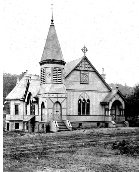
St. Elmo Presbyterian Church circa 1890