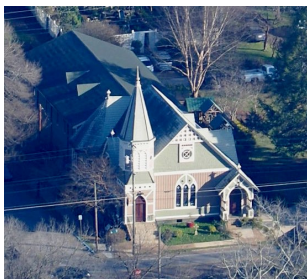
SEPC viewed from Lookout Mountain

SEPC exists in close proximity to several other churches in the Chattanooga area, many of them in the PCA. SEPC is also near two Christian educational institutions with which the church has strong partnerships and connections—Covenant College (the college of the PCA) and Chattanooga Christian School, a K-12 institution. Many church members are employed at these institutions as tenured professors and teachers, and SEPC draws students from both.