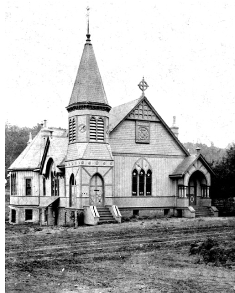
St. Elmo Presbyterian Church circa 1890