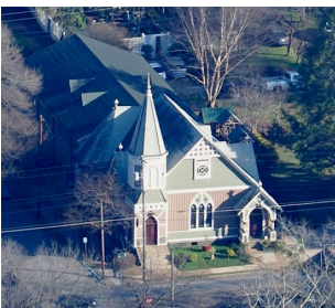
SEPC viewed from Lookout Mountain

SEPC exists in close proximity to several other churches in the Chattanooga area, many of them in the PCA. SEPC is also near two Christian educational institutions with which the church has strong partnerships and connections—Covenant College (the college of the PCA) and Chattanooga Christian School, a K-12 institution. Many church members are employed at these institutions as tenured professors and teachers, and SEPC draws students from both.